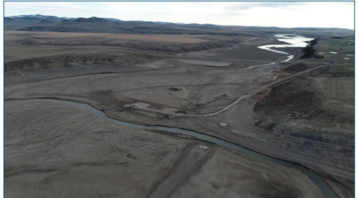
The construction of new intakes and associated pipelines in the Oldman Reservoir (April 18th, 2024)

Although some demand reductions could be necessary, the MD anticipates avoiding water hauling and temporary pumping this year—regardless of how low the Oldman Reservoir drops—thanks to the new intakes, and provided no significant unforeseen issues arise (such as major line breaks or system shut-downs).